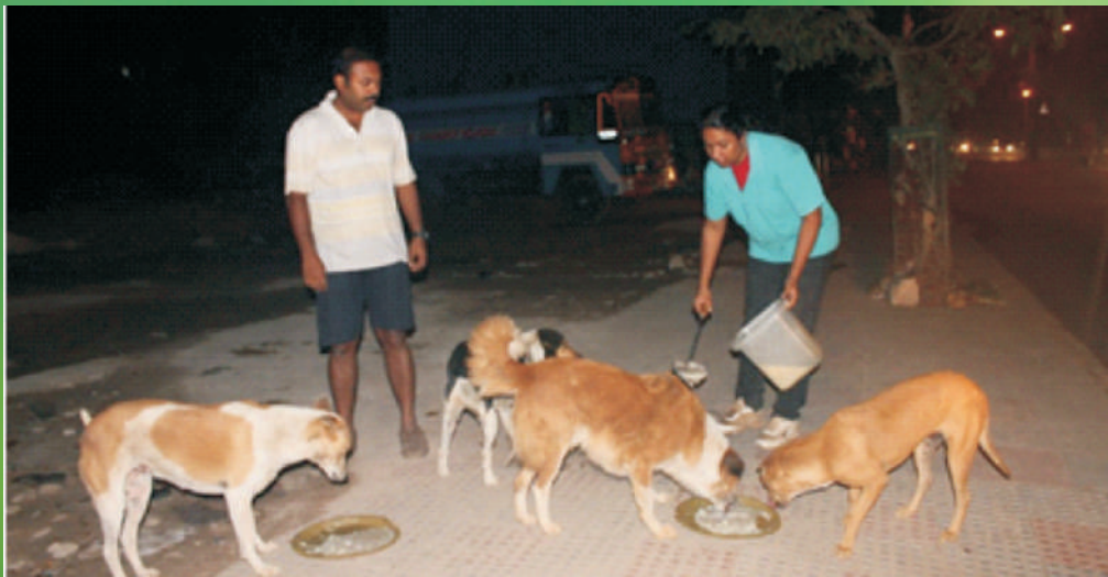
Just these small steps can help make a difference